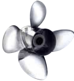
Apollo® XHS® Stainless Steel Propeller

450 HP .....1995 465 HP ..... 1991 & 1994